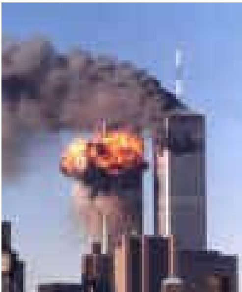
(left) On September 11, 2001, terrorists attacked and destroyed the World Trade Center in New York City.