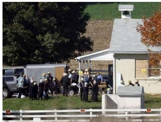
(right) October 2, 2006 Amish school in rural Pennsylvania experiences deadly violence incident.