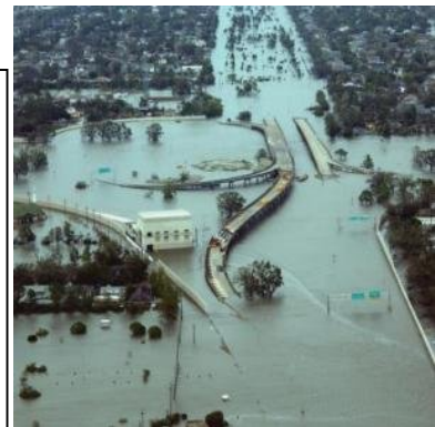
(right) August, 2005 Katrina, a category 5 hurricane devastated the New Orleans metropolitan area