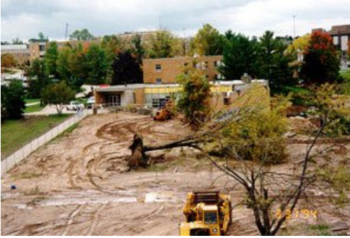
(left) Destruction to the Ferris State University Campus after an F0 tornado hit Big Rapids in October, 1998.